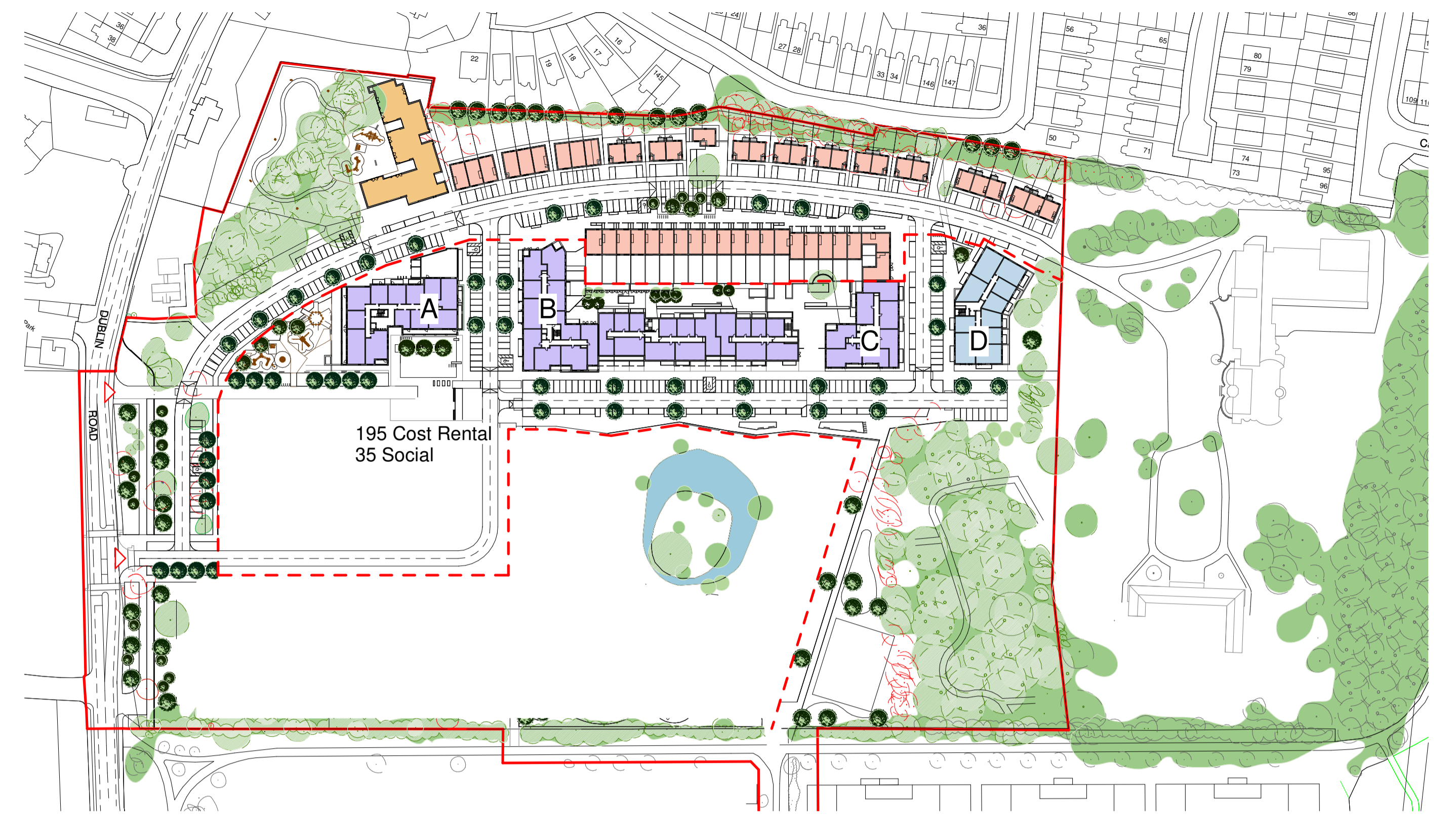
2 Site Construction Phasing 02