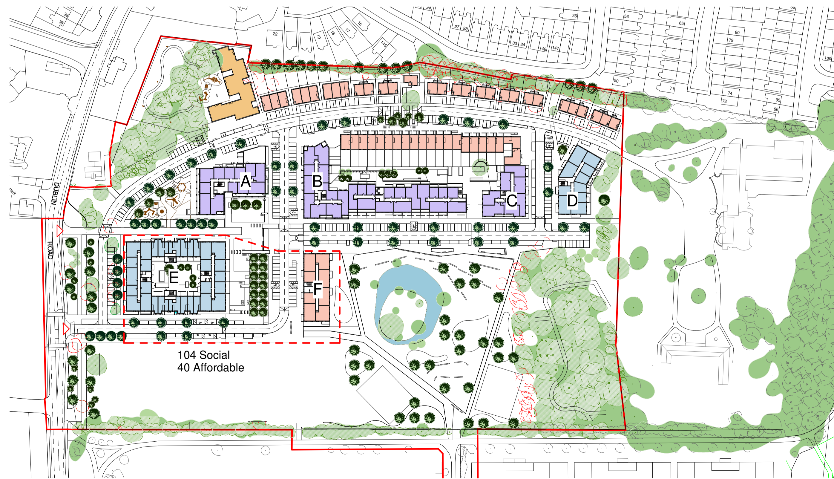
3 Site Construction Phasing 03