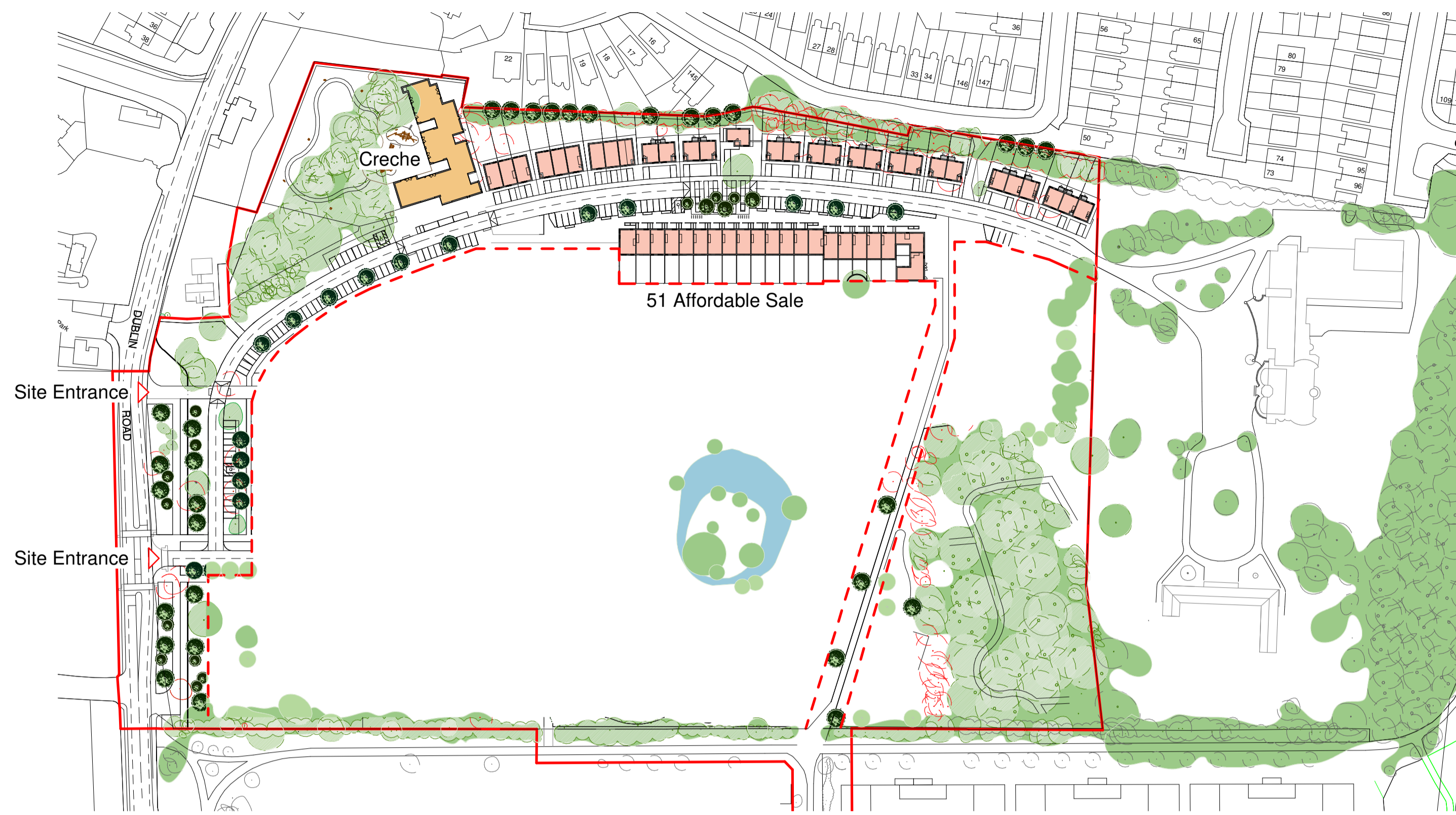
1 Site Construction Phasing 01