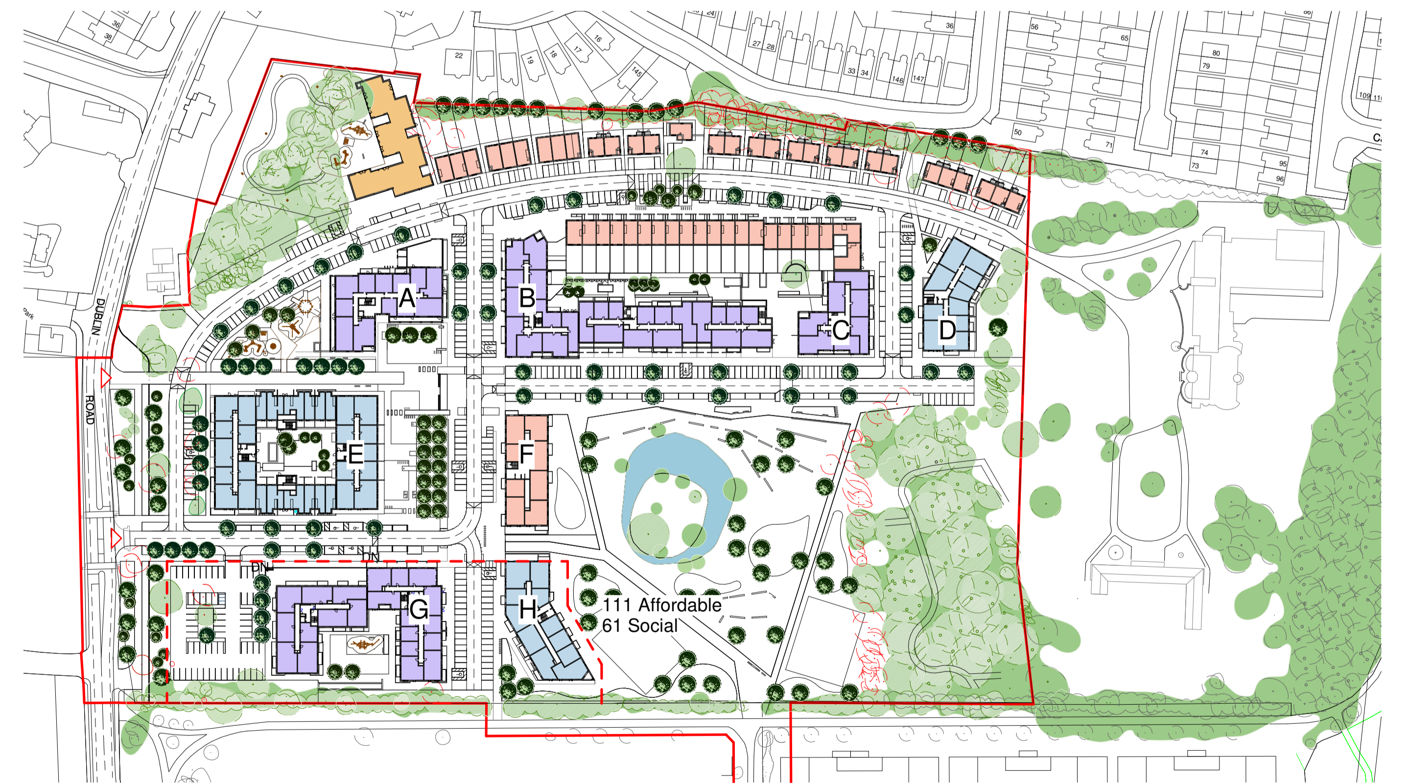
4 Site Construction Phasing 04